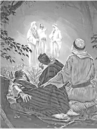
The Transfiguration of our Lord

11th February 2018 - Sunday Next Before Lent